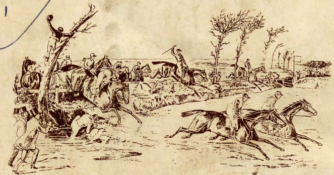
THE CHRISTENING OF THE BROOK BY CAPT. BECHER, 1839.